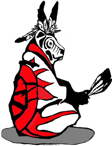
Todd Jamieson YCDSB Knowledge Keeper

Nous sommes rassemblés sur les eaux et les terres ancestrales de tous les peuples autochtones, qui ont laissé leurs traces sur la Terre Mère avant nous.