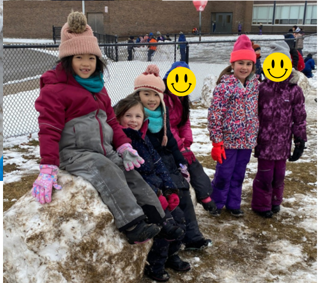
Students made the most of the snowfall on Thursday, building forts, snow people and towering structures. We hope there's more snow to come!